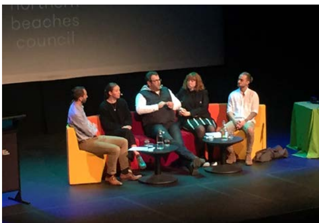
Photo: Big Ideas Forum - June 2019

Suicide bereavement charity WINGS of Hope held an intimate gathering at Balmoral in November 2019 for International Survivors of Suicide Loss Day. The gathering aimed to honour and remember those we have lost to suicide, and to inspire hope by reminding those bereaved by suicide that they are not alone. The gathering was supported by CCNB and Northern Beaches Council.